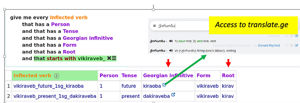
Fig. 2: Two lemmas for inflected form “vikiraveb” (Georgian infinitive and root)

Figure 2 shows the query and result areas after the user clicked on the 3 suggestions. The query has been automatically updated. We see that the inflected form is “vikiraveb”. The “Georgian infinitive” and “root” features have been added. In the results area, two columns have appeared giving the two pieces of information sought. The Georgian infinitive is “kiraoba” (ქირაობა) for the present form and “dakiraveba” for the future form. The root is “kirav” for both forms. We can also see that both forms correspond to the first-person singular. Clicking on the arrow at the right of each of the Georgian Infinitive opens a new window to access the translate.ge site. We can see that “kiraoba” can mean “to hire” or “to rent”.