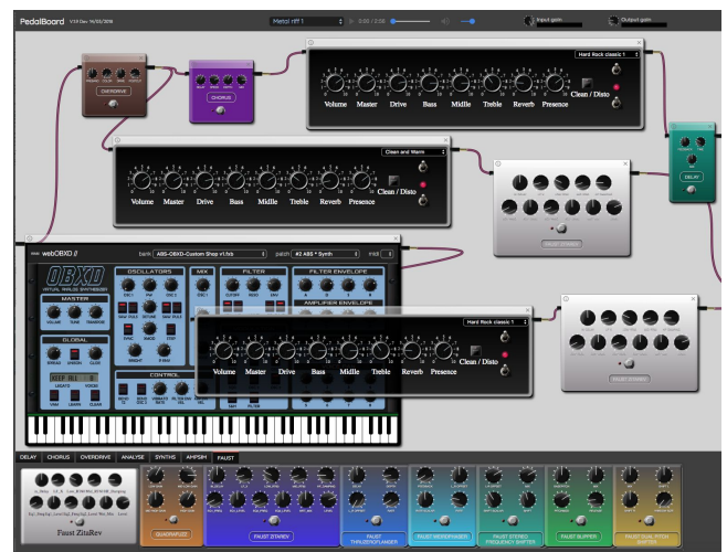
Figure 2: Different plugins connected inside a virtual pedal board. In black: some amps simulators

Here, we will detail first how we built on these previous works in order to generalize our approach towards any tube amp simulations. Instead of simply emulating a single guitar amp, we have now a versatile amp designer where one can select and tune the different parts that compose an amplifier: preamp, tonestack, power amp, speaker simulation, reverb, ... and then assemble those in different topologies, using filter banks between or inside these stages (Fig. 1). This modular tools make it possible to create specific amp designs targeted to get clean, crunch/bluesy, classic rock distortion, hi gain/metal sounds, etc. The final result can be a single specific amp or some multi channel amp with switchable designs 2 (ex: a clean and a crunch channel).