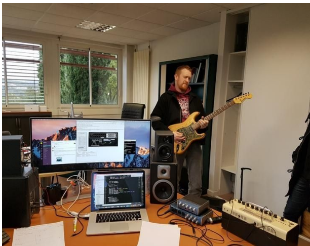
Figure 3: A typical benchmark/demo setup: a guitar, a low latency sound card, some speaker and a Web browser with our Web Audio apps running.

We did the proof of concept that many plugins could be easily included from multiple origins: (1) written in pure JavaScript / Web Audio -we made a dozen of such plugins, including the guitar tube amp simulators, and ported some others created by other developers (such as a general midi synth, etc.), (2) WebAudioModules (VST/JUCE native plugins ported to WebAssembly/AudioWorklet) or (3) written in FAUST, a popular DSL for writing DSP code, here again ported to WebAssembly/AudioWorklet. Other sources / importers are planned (eg. MAX DSP/Pure Data). Most plugins are controllable using midi controllers. We will demonstrate how easy this scheme works 3 .